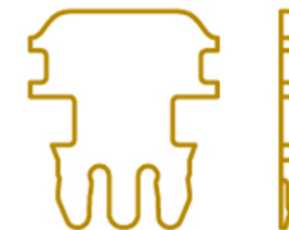
Three prong pin (not to scale)